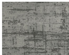
2261 Haze Grey