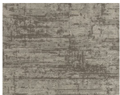
2255 Warm To...