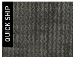
3635 Cinder Smoke