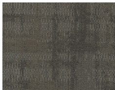
3634 Toasted Ash