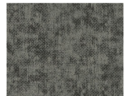
3646 Crisp Air