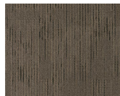
3336 Fiber Stitch