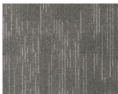
3334 Tweed St...