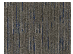
3338 Nubby Sti...