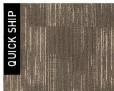
3335 Strand St...