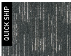
3340 Knot Stitch