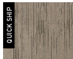
3337 Texture S...