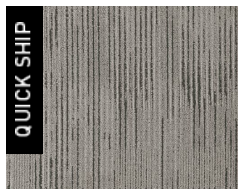
3339 Warp Stitch