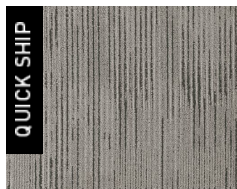
3339 Warp Stitch