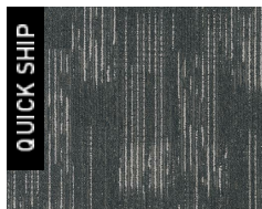
3340 Knot Stitch