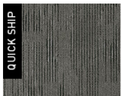
3333 Knit Stitch