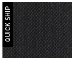
1429 Photo Op