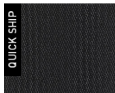
1429 Photo Op