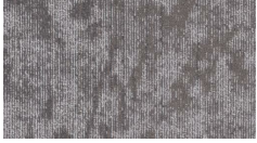
3481 Stratus Na...