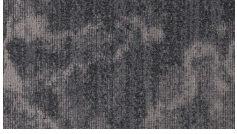
3492 Cirrus Co...