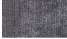
3489 Strato Na...