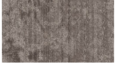
3483 Cirro Nat...