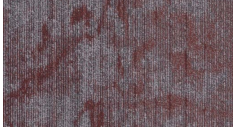
3488 Strato Co...