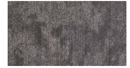
3485 Alto Natu...