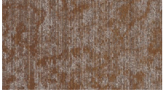
3482 Cirro Color