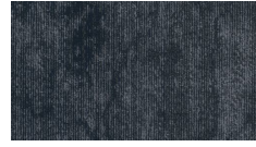
3490 Cumulo C...