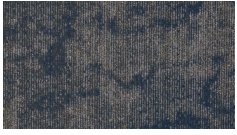
3486 Nimbus C...