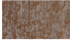
3482 Cirro Color