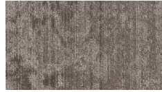
3483 Cirro Nat...