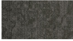
3487 Nimbus N...