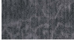
3493 Cirrus Na...