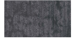
3491 Cumulo N...