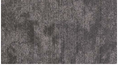
3485 Alto Natu...