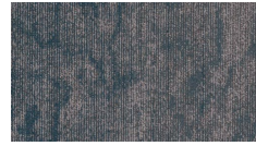
3484 Alto Color