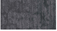
3491 Cumulo N...