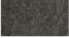
3487 Nimbus N...