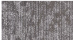
3481 Stratus Na...