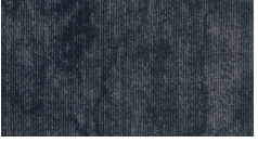
3490 Cumulo C...