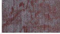
3488 Strato Co...