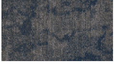
3486 Nimbus C...