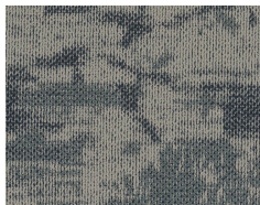
3648 Wild Indigo