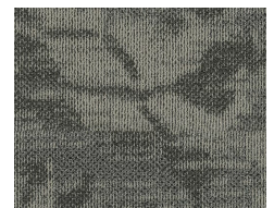
3646 Crisp Air