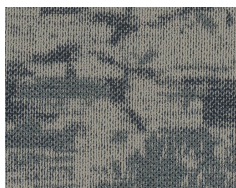
3648 Wild Indigo