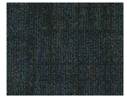
2388 Out Of The...