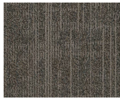
2383 On A Whim