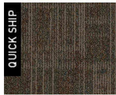
2384 At First Gl...