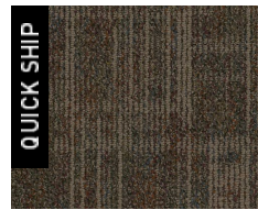
2384 At First Gl...