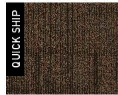
2385 Free Spirit