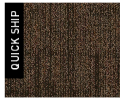
2385 Free Spirit