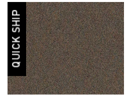
8400 Take A Trip