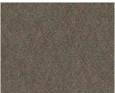
8403 Take A D...