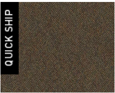
1807 Jump Righ..