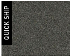
1808 Make A M...