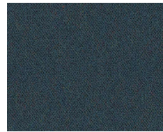
3408 Call An Old..