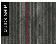
3348 Red Pace