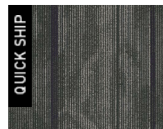
3350 Purple Pa...