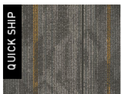
3353 Gold Lead