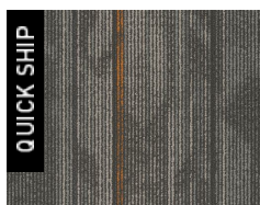
3354 Orange L...