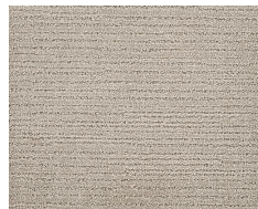
9832 Pebble Be..