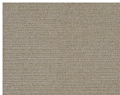
9785 Cypress P...