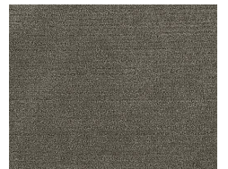
9945 Glen Abbey