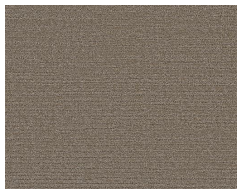
9999 Sand Hills