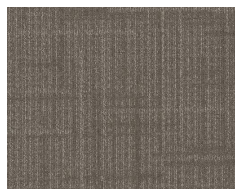
3330 Turn It On