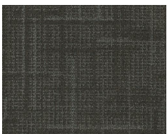
2464 Turn The ...