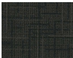
2467 Turn Of E...