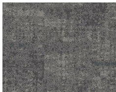
3630 Sea Salt