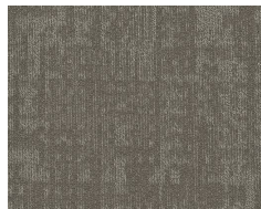
3330 Turn It On