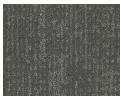
2464 Turn The ...