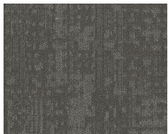
2464 Turn The ...