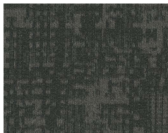
2467 Turn Of E...