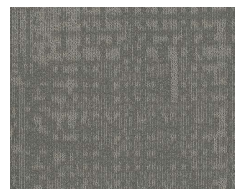
3332 Turn Of The...