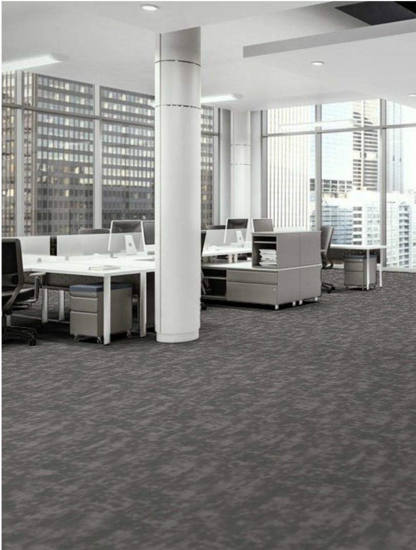
Installation Methods: Brick, Monolithic, Ashlar, Quarter Turn