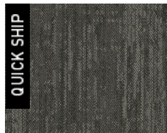
3635 Cinder Smoke