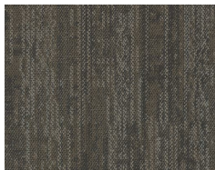
3634 Toasted Ash