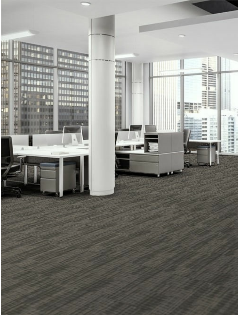
Installation Methods: Brick, Monolithic, Ashlar, Quarter Turn