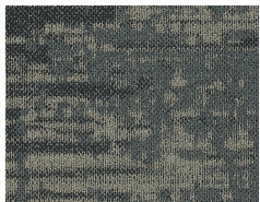
3647 Blue Spru...