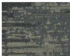
3647 Blue Spruce