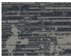
3648 Wild Indigo