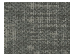
3646 Crisp Air