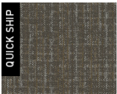
3563 Essential A...