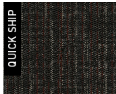
3565 Key Accent