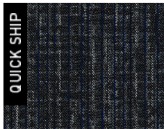
3570 Innate Ac...