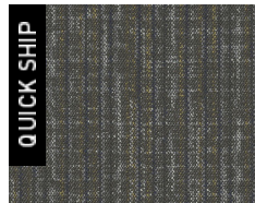
3566 Central A...