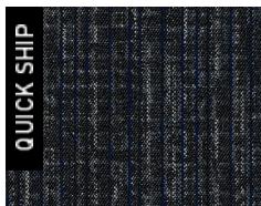
3570 Innate Ac...