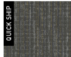
3566 Central A...