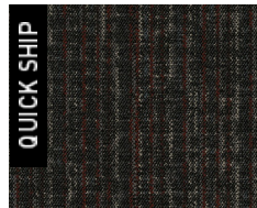
3565 Key Accent