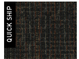
3568 True Acce..