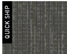
3566 Central A...