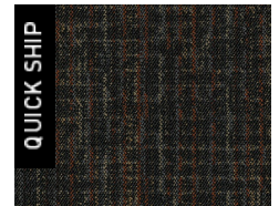
3568 True Acce..