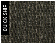
3564 Authentic ...