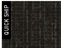
3565 Key Accent