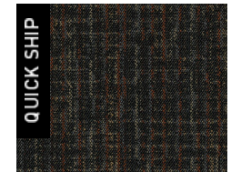
3568 True Acce..