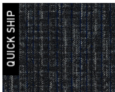
3570 Innate Ac...