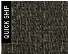
3564 Authentic ...