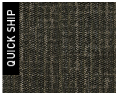
3564 Authentic ...