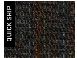
3568 True Acce..