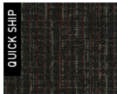
3565 Key Accent