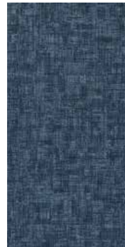
COLOR 1134 denim