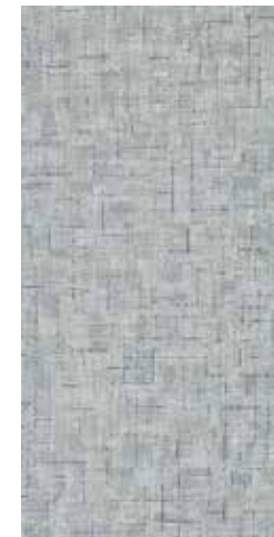
COLOR 1123 common violet