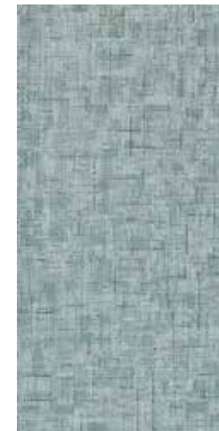
COLOR 1137 forest watch