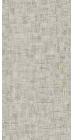
COLOR 1127 oatmeal