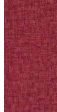
COLOR 1126 garnet