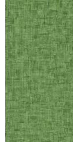
COLOR 1136 limeade