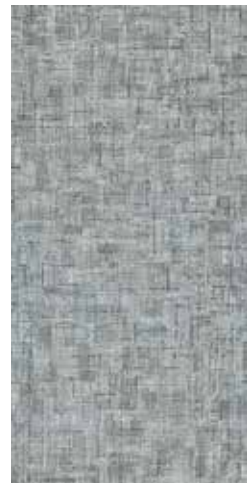
COLOR 1121 all purpose