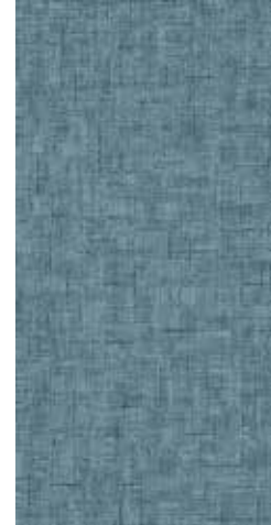
COLOR 1132 sky