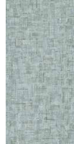
COLOR 1135 lime green