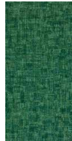
COLOR 1138 forest