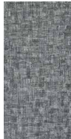
COLOR 1130 shadow