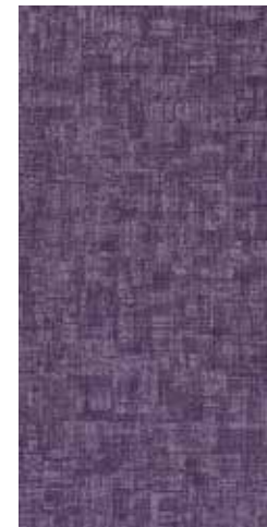
COLOR 1124 violet