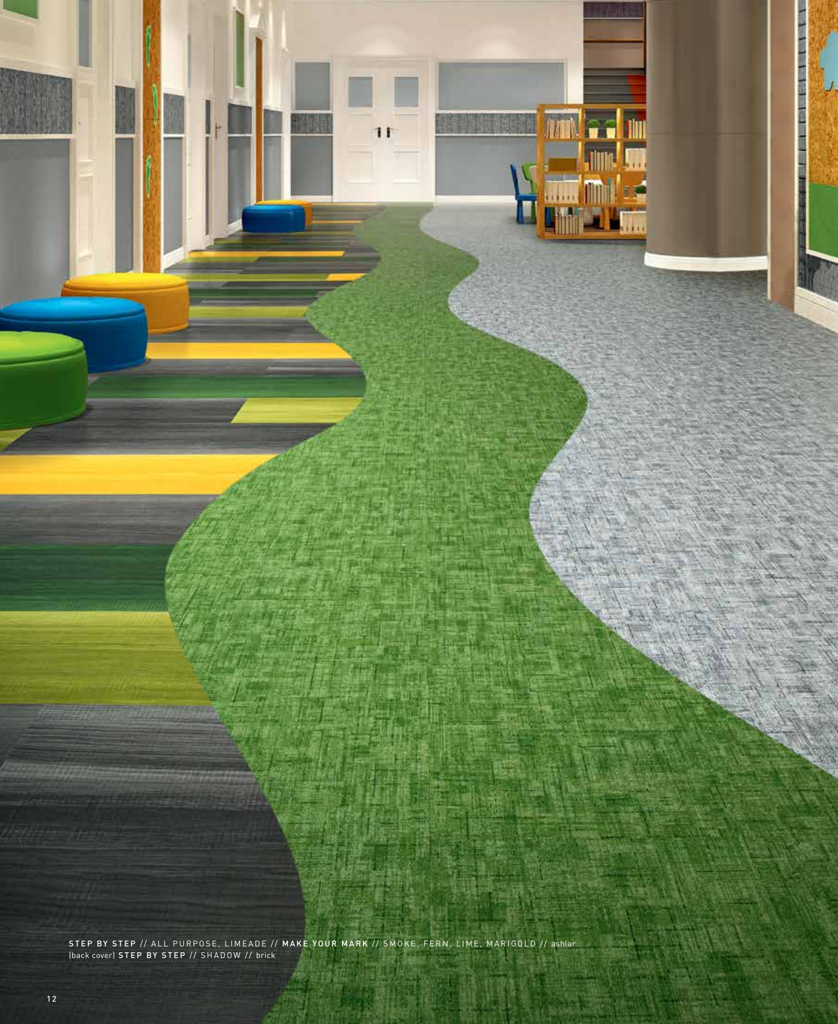
STEP BY STEP // ALL PURPOSE, LIMEADE // MAKE YOUR MARK // SMOKE, FERN, LIME, MARI GOLD // ashlar (back cover) STEP BY STEP // SHADOW // brick