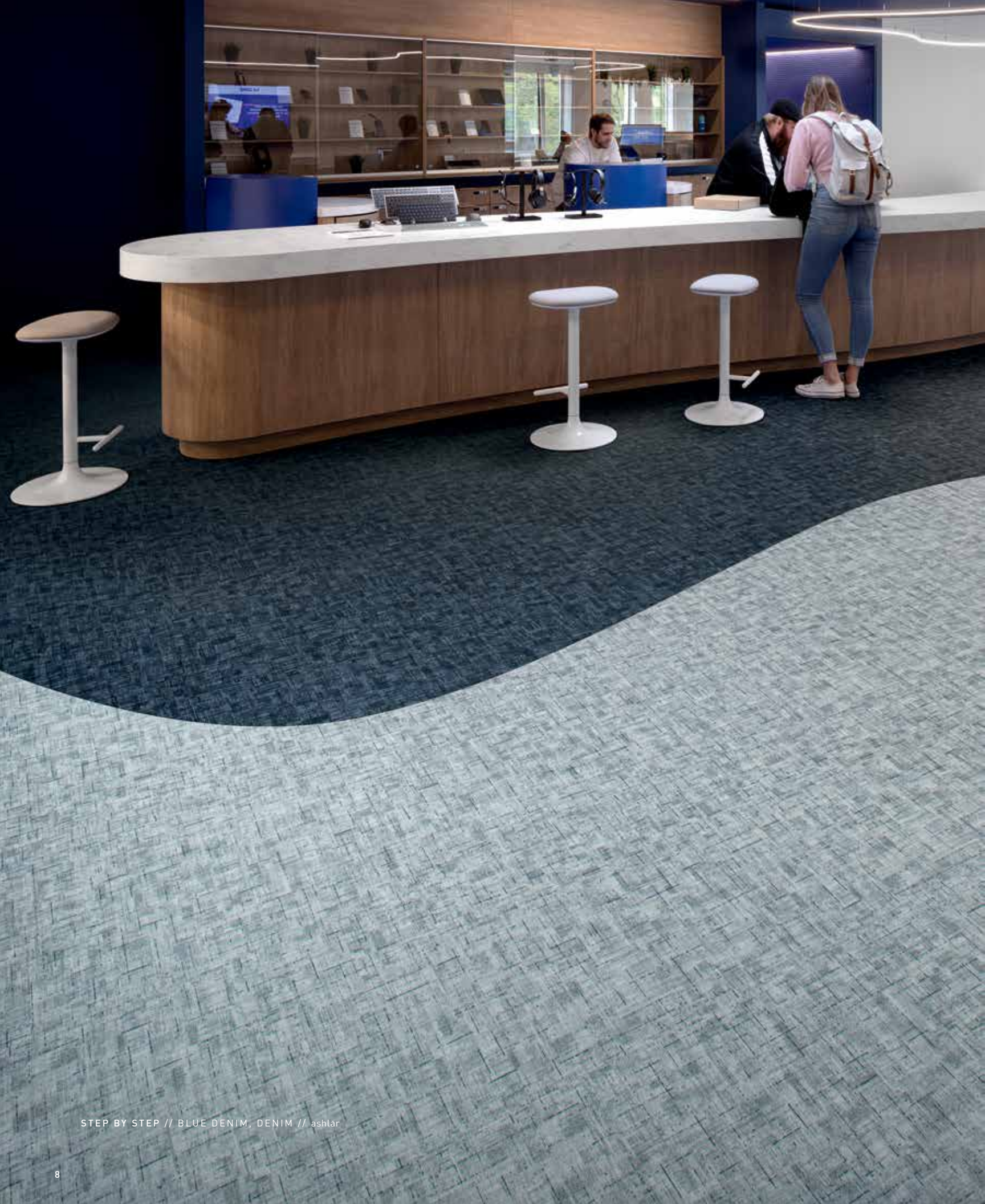
STEP BY STEP // BLUE DENIM, DENIM // ashtar