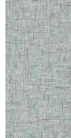
COLOR 1125 iron garnet