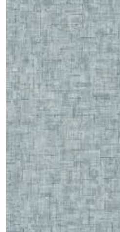
COLOR 1131 sky blue