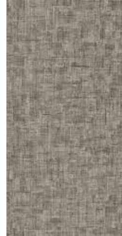
COLOR 1128 natural