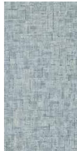
COLOR 1133 blue denim