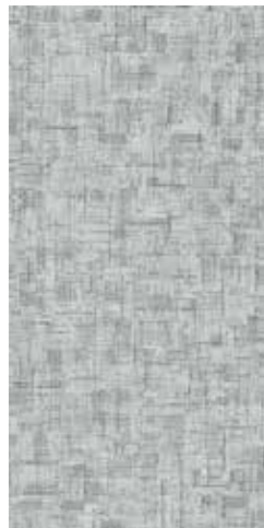
COLOR 1122 sheer