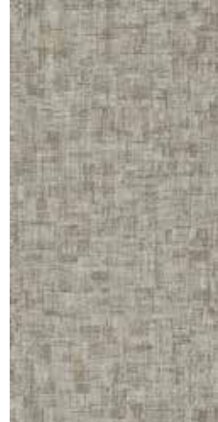
COLOR 1129 egg shell